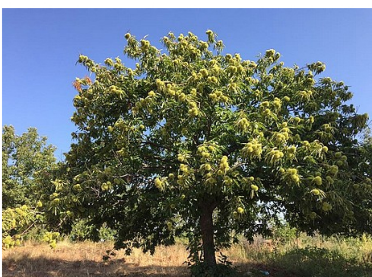
Chestnut trees in the Turkish plantation of the company EGE Kaptan

Since both the southern European and the Turkish varieties are sold as chestnuts, many consumers believe that these products are the same. But that is by no means the case, Kaptan says. "There are many sweet chestnuts marketed as chestnuts. In contrast to the sweet chestnuts, our main varieties Sekerci and Kemer are easy peelable, vein-free and they are sweeter. What's more, our chestnuts have a Global Gap certification: this means that production safety is ensured by strict quality control. This guarantees the highest quality of chestnuts."