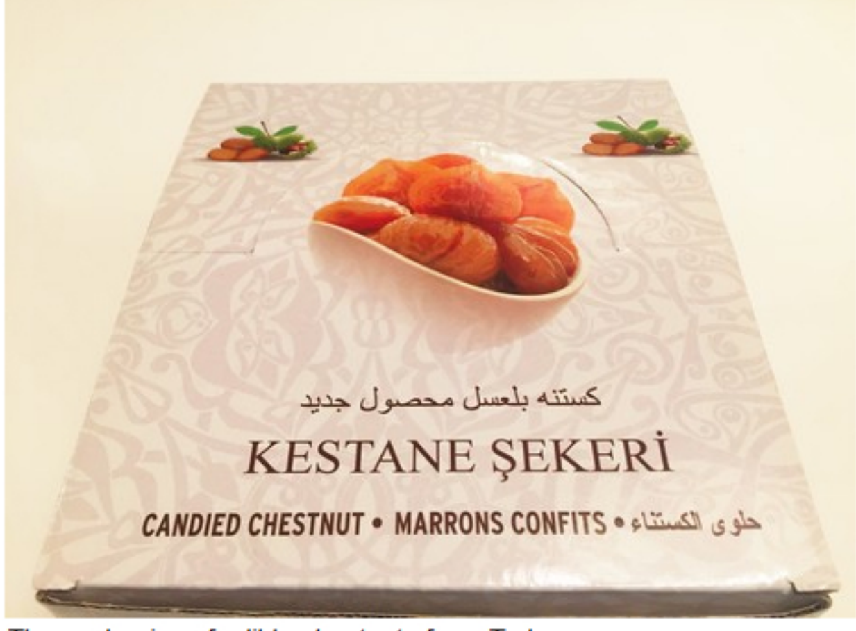
The packaging of edible chestnuts from Turkey

The managing director emphasizes that the knowledge about chestnuts in general still lags behind considerably. "If consumers knew what chestnuts are all about, there would be the same demand as there is for walnuts or macadamia nuts. Maroons are gluten-free and contain many antioxidants that support a healthy diet. Chestnuts are also very interesting for vegans. The chestnuts can gain a foothold in German and foreign cuisine, whether in chestnut soups, as a side dish for roast venison, as a dessert or as a snack from the oven. There is no limit to the possibilities."